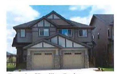
Example of Dwelling, Duplex