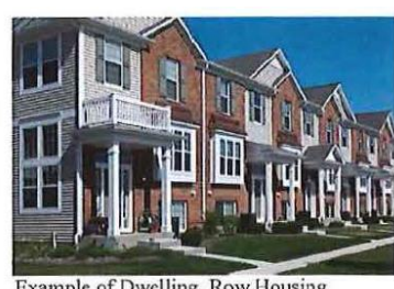
Example of Dwelling, Row Housing

"Dwelling, Single Detached" means a residential Building containing one (1) Dwelling Unit and is intended as a permanent residence. A Single Detached Dwelling may include a building that has been constructed ofsite (Modular Home). All Single Detached Dwellings constructed outside the Province of Alberta must meet the standards of the Alberta Safety Codes Act, as amended. Single Detached Dwellings do not include Manufactured Homes.