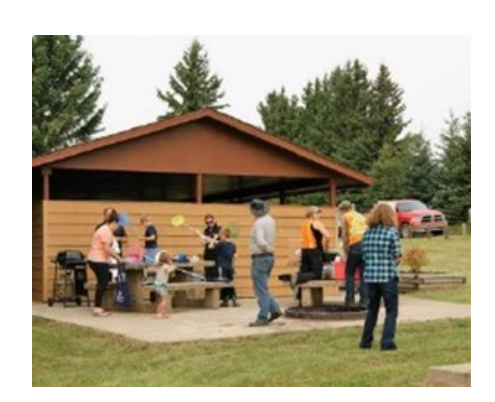
Fun at Lindsay A. Evans Regional Park in 2017